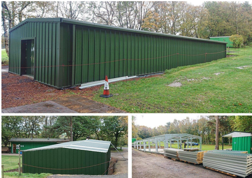
Construction of 24m x 7m indoor shooting range